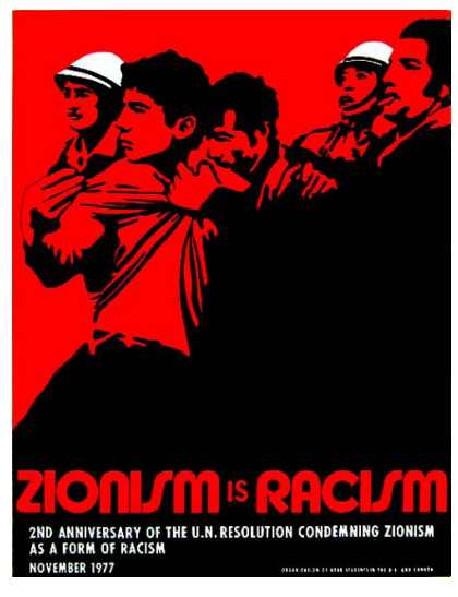
THE LATE SENATOR DANIEL PATRICK MOYNIHAN DESCRIBED AS "OBSCENE" THE UN'S ZIONISM-IS-RACISM RESOLUTION, WHICH FOUND ZIONISM TO BE A FORM OF RACISM AND RACIAL DISCRIMINATION. FOR 15 YEARS, AMERICAN JEWISH COMMITTEE (AJC) LED THE ULTIMATELY SUCCESSFUL FIGHT TO REVOKE THIS ODIOUS LIE.

The irony is startling. On a wall just outside UN headquarters in New York City, there is a quotation from the biblical prophet Isaiah envisioning world peace: "They will break their swords into plowshares and their spears into pruning hooks. Nation shall not lift sword against nation, nor shall they learn war anymore." Created in 1945 in the wake of World War II and the Holocaust to actualize that vision, the UN has become a major sounding board for hatred of the world's only Jewish state.