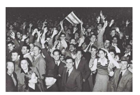
CROWDS IN TEL AVIV CELEBRATE THE UN'S VOTE FOR PARTITION IN 1947.

The UN helped create the State of Israel by its 1947 partition resolution that called for dividing Palestine into Jewish and Arab states—a step accepted by the Jews, who proclaimed the independence of Israel the next year, but not by the Arabs, who fought, unsuccessfully, to destroy it. Israel became a member of the UN in 1949.