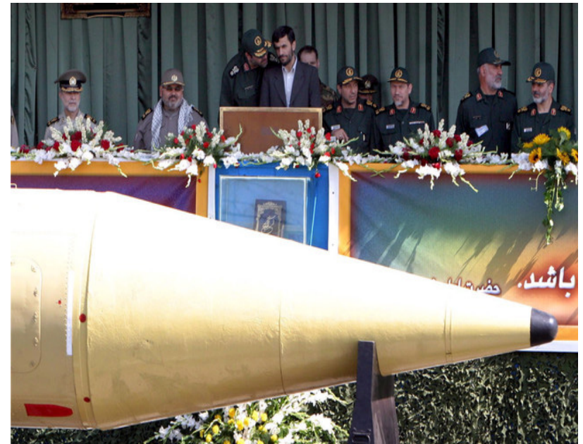
Showcasing Iranian weaponry, President Ahmadinejad stands at the podium in the center

“I am telling those fake superpowers that the Iranian nation became independent 27 years ago and ... on the nuclear case it will resist until fully achieving its [nuclear] rights.” 1