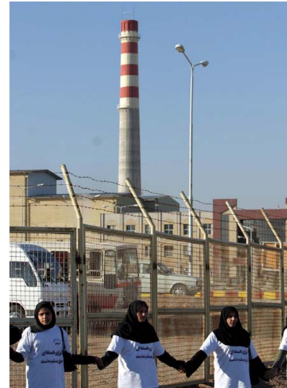
Iranian women participating in a pro-nuclear, state-run protest in front of a uranium enrichment plant

“If a day comes when the world of Islam is duly equipped with the arms Israel has in its possession, the strategy of colonialism would face a stalemate because application of an atomic bomb would not leave anything in Israel, but the same thing would just produce damages in the Muslim world.” 4