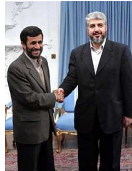
President Ahmadinejad with Hamas leader Khalid Al-Mish'al

— President Ahmadinejad, speaking at "The World Without Zionism" conference, October 2005