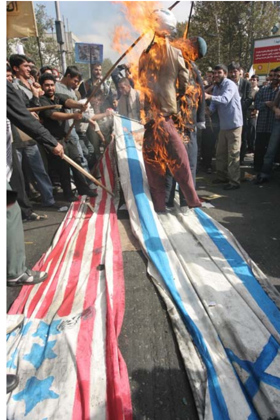
Burning of the U.S. and Israeli flags on a Tehran street

“The invisible hand of the Zionists and other foreigners in the bloody incidents and blasts in mosques and religious places ... is completely active.” 26