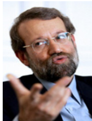
Ali Larijani, Iran’s chief nuclear negotiator

— Ali Larijani, speaking about the possibility of Israel attacking Iran’s nuclear facility, January 2006