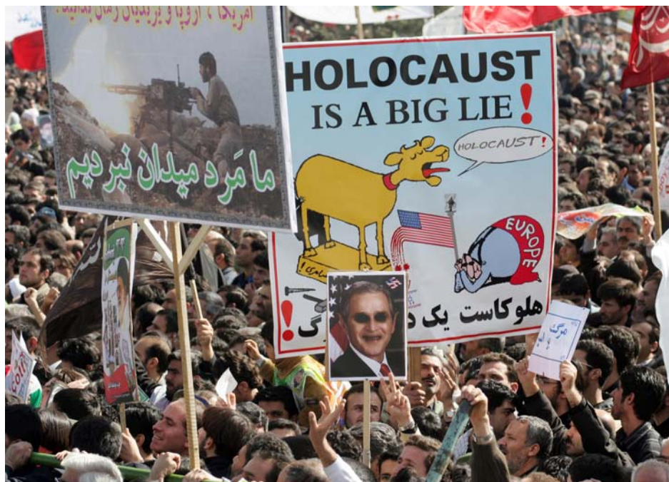
Iranians rally on the 27th anniversary of the victory of the Islamic Revolution