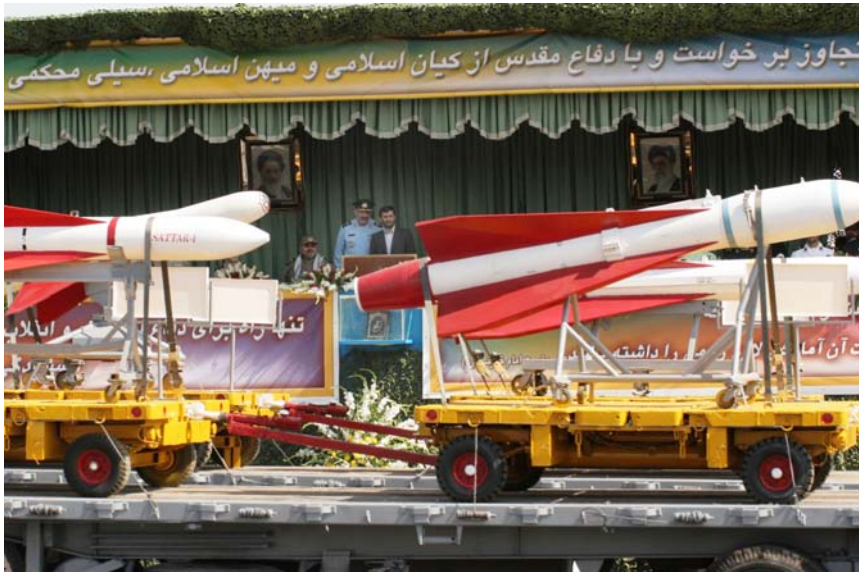
President Ahmadinejad delivers his address in Tehran at the beginning of Iran's Sacred Defense Week where “Sattar 1” missiles are displayed

— President Ahmadinejad, rejecting the validity of UN Security Council sanctions on Iran, December 2006