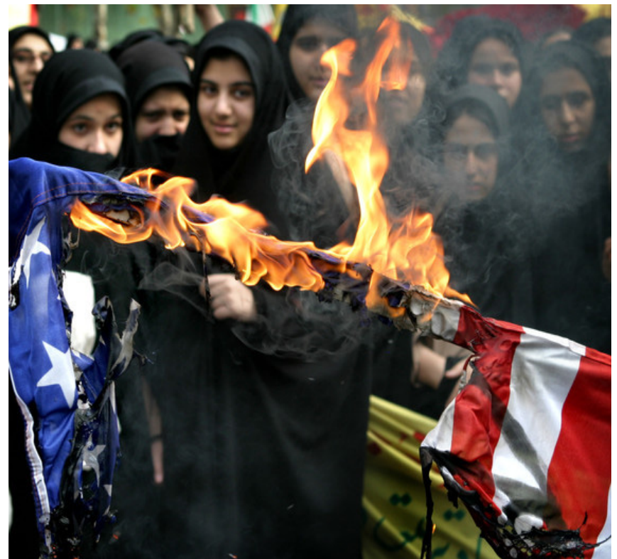
Iranian women burning a U.S. flag on a Tehran street

“They [the U.S. and Israel] are cheeky humans, and they think that the entire world should obey them.” 12