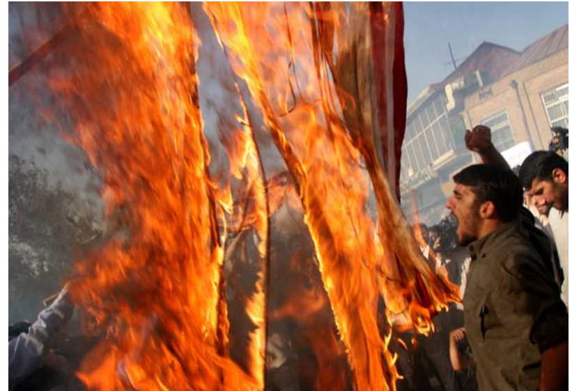
Burning of a U.S. flag outside of the British Embassy in Tehran

“The language of the U.S. president resembles the language of Hitler.... If Hitler had to show the face of a bloodthirsty dictator, he would have had to adopt [the face of] George W. Bush.” 7