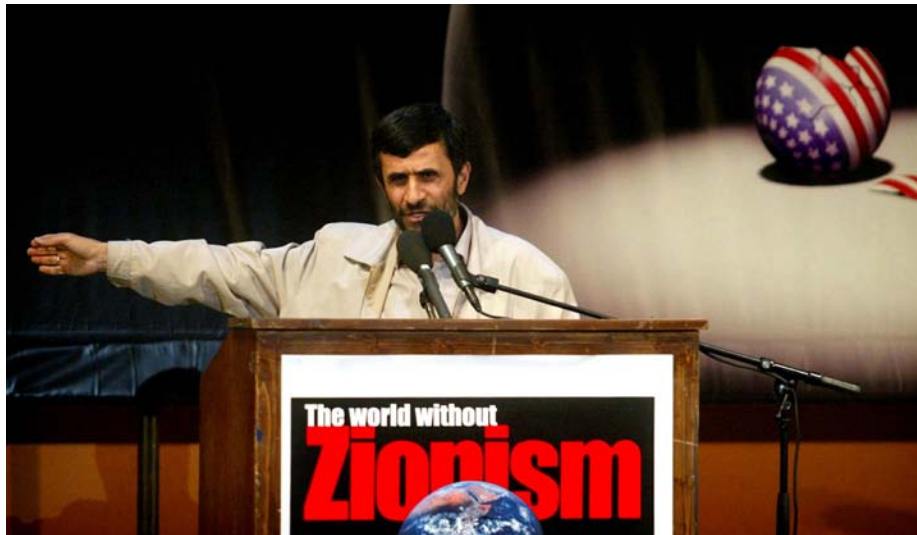
President Ahmadinejad speaking at "The World Without Zionism" conference

"Very soon, this stain of disgrace [Israel] will vanish from the center of the Islamic world – and this is attainable." 20