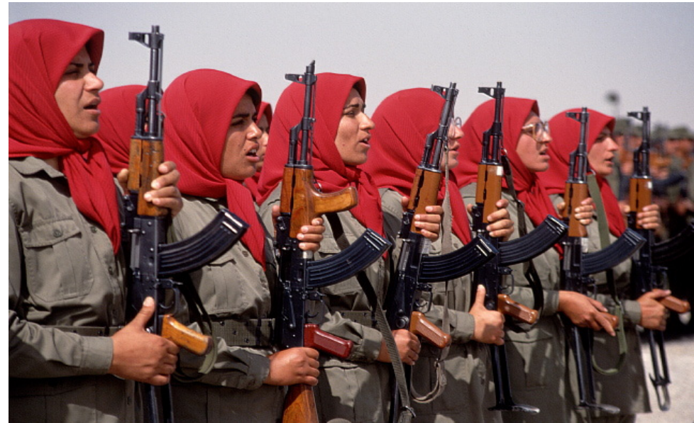
Female Iranian Mujahideen Soldiers

“Jihad means to strive for the lofty values.... Whoever fights for these values ... Allah's angels point to him in heaven. Do not consider those who are slain in the cause of Allah as dead.... When this great nation, with its zealous and faithful youth ... resist the enemy ... [Iran] will let [the West] taste defeat once more.” 19