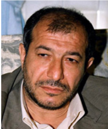
Mostafa Mohammad Najjar Minister of Defense

“Zionists should know that if they do anything evil against Iran, the response of Iran’s armed forces will be so firm that it will send them into eternal coma, like [Prime Minister] Sharon.” 24